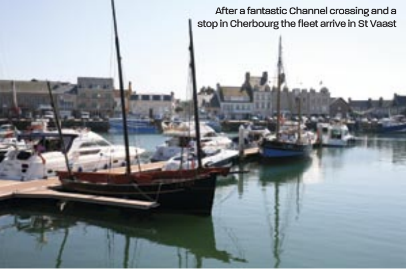
After a fantastic Channel crossing and a stop in Cherbourg the fleet arrive in St Vaast