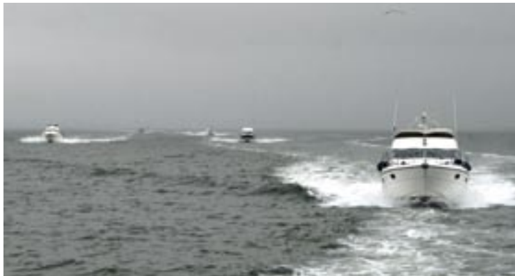
The fleet leave Carentan and head across the Channel before the weather turns