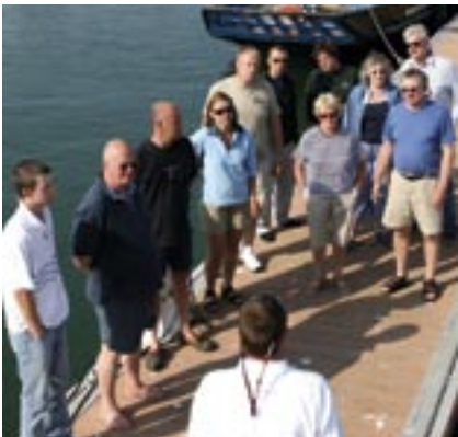
A quick briefing before departing for St Vaast

Our first 2008 cruise kicked off in near-perfect conditions, so our small flotilla experienced a fantastic inaugural trip across the Channel